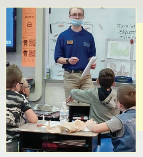
A day teaching elementary schoolers about wildlife habitat.

Nature photography is one of my favorite things to do now because of this experience. Since then I have made up my own portfolios full of pictures. As a Boy Scout, as well, I have applied what I learned in the Academy to lead others in my troop. My Eagle Project helped out the Game Commission with local game lands. I know for certain that I will always cherish and treasure